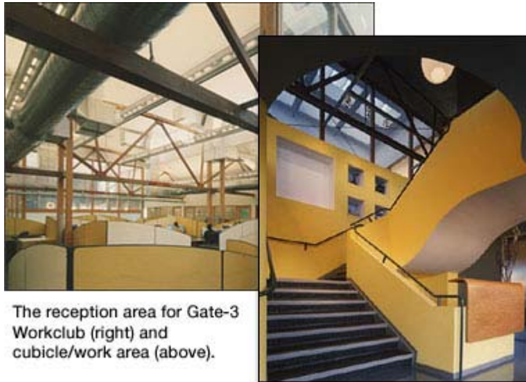
The reception area for Gate-3 Workclub (right) and cubicle/work area (above).